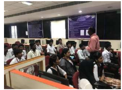
Career objective training