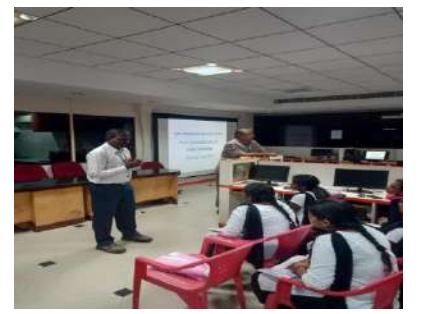
Public speaking training